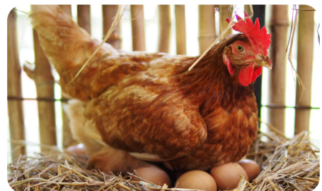
eggs from chickens

Some other foods also come from animals.