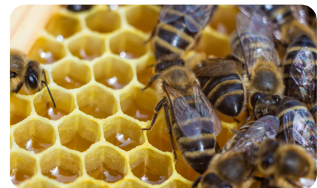
honey from bees