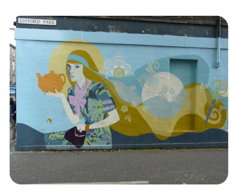
The Gifford Park mural by Kate George, 2015

A mural is a large picture that is usually painted onto a wall, ceiling or other structure.