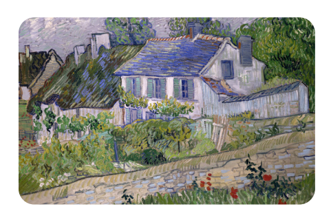
Houses at Auvers by Vincent van Gogh, 1890