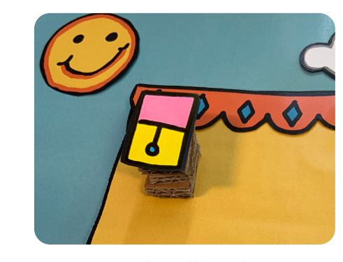
Five layers of cardboard make this window stand out.

Layers of corrugated cardboard can be glued to the back of cut outs to create a 3-D effect.