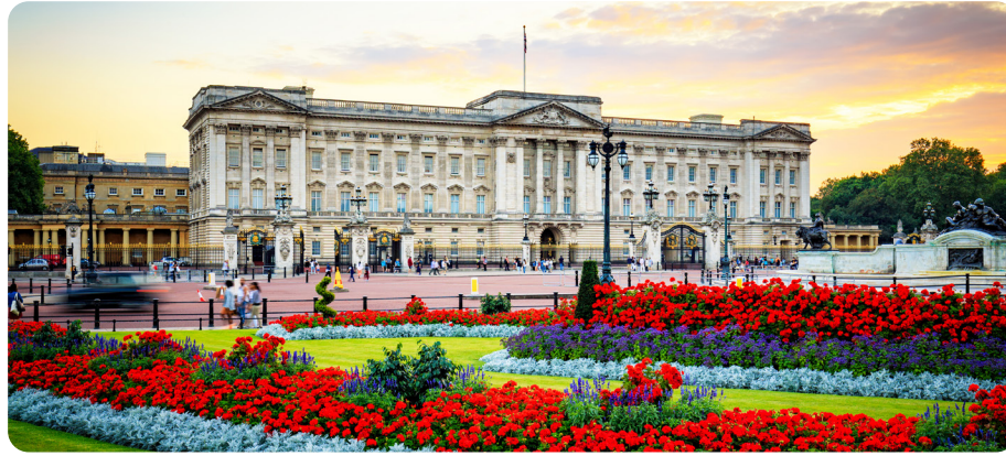
Buckingham Palace is in London, England.

Royal residences include palaces, castles and stately homes. Some of them are used for official royal business. Some are used as holiday or private homes. Many are tourist attractions.