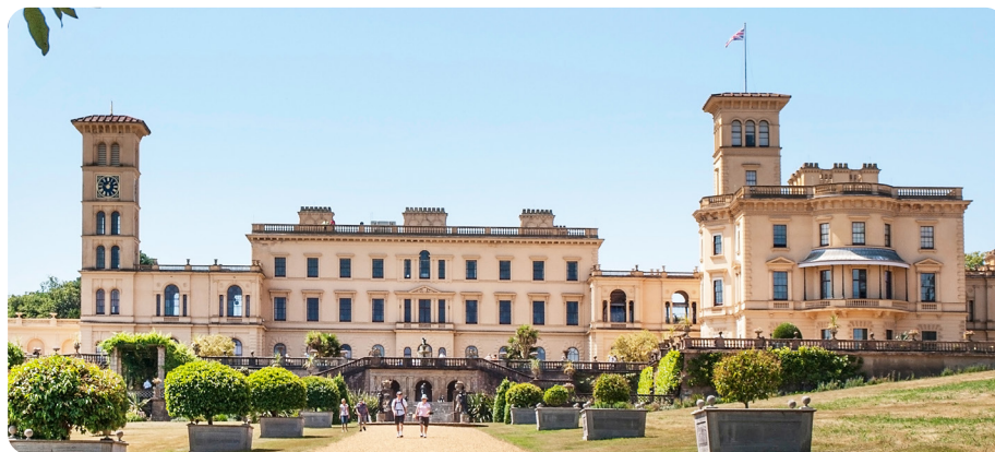
Osborne House is on the Isle of Wight, England.