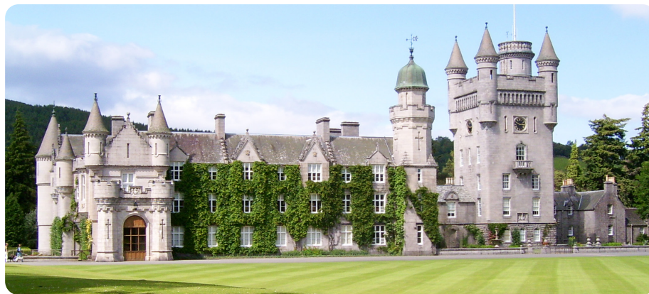
Balmoral Castle is in Aberdeenshire, Scotland.