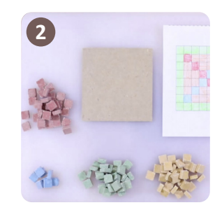
Sort tesserae by colour.