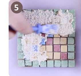
Use a glue spreader to to press grout into the interstices.