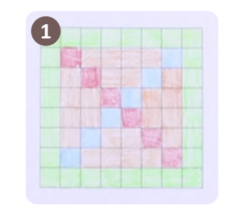
Create a design on a grid template.