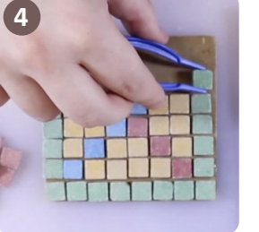
Stick tesserae to the board, leaving interstices. Leave to dry.