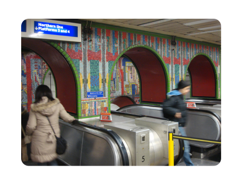
Mosaic at Tottenham Court Road Underground station in London, 1986