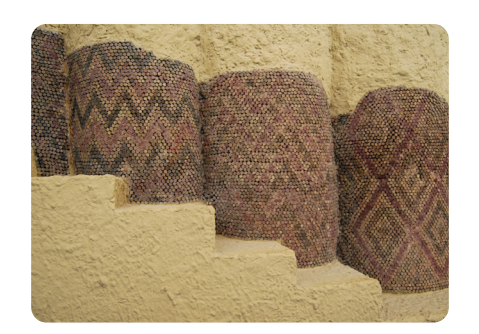
Columns decorated with clay cone mosaics, c3000 BC

Mosaics have been used since c3000 BC and are still used today.