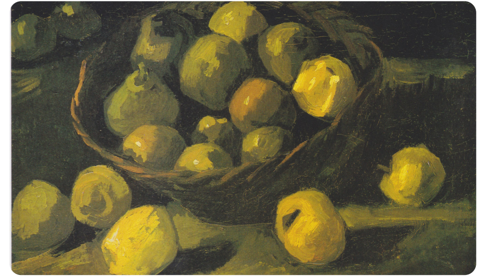
Still Life with Basket of Apples by Vincent van Gogh, 1885

Tints and shades are used in paintings to create light and shadow. This painting by Vincent van Gogh is a good example of the use of tints and shades. The apples in the foreground are painted in tints of green to emphasise light. The apples in the background are painted in shades of green to show that they are in the shadows.