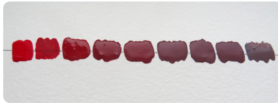
tones of red

A tone is a colour mixed with grey. Tones are less vibrant than the original colour. Using a tonal colour in a painting balances other intense colours and bright hues. When mixing a tone, begin with the pure colour and add grey paint a tiny bit at a time.