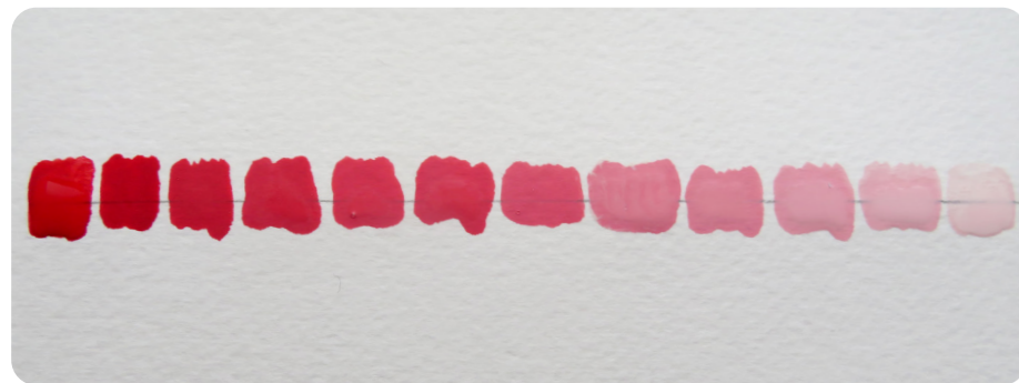
tints of red

A tint is a colour mixed with white. The more white paint that is added to the original colour, the lighter the tint. A tint can range from slightly lighter than the original colour, to almost white. When mixing a tint, begin with the pure colour and add white paint a tiny bit at a time.