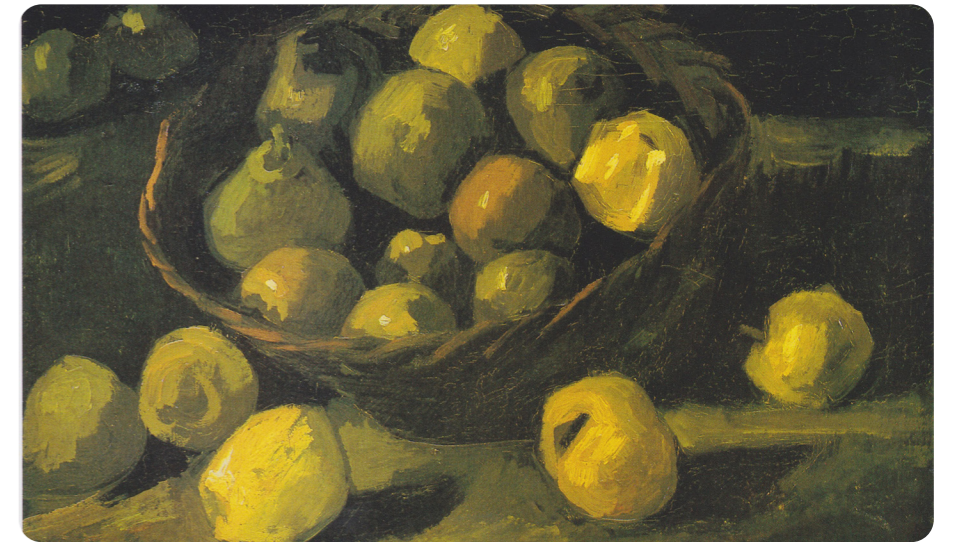
Still Life with Basket of Apples by Vincent van Gogh, 1885

Tints and shades are used in paintings to create light and shadow. This painting by Vincent van Gogh is a good example of the use of tints and shades. The apples in the foreground are painted in tints of green to emphasise light. The apples in the background are painted in shades of green to show that they are in the shadows.